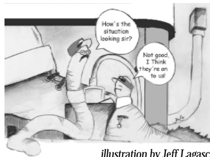
illustration by Jeff Lagasca

During the summer, two powerful computer viruses spread through the Internet community. One of the virus worms, named Code Red, targeted Web servers running Microsoft Internet Information Server (IIS). The other virus, identified as W32/Sircam, focused its infectious activity on personal computers. Each of these viruses continues to present the campus with a unique challenge, but there are steps we can all take to reduce the likelihood of becoming infected by either one.