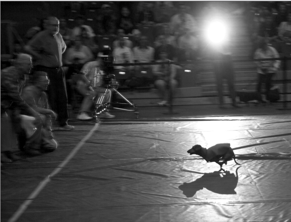
Nearing the finish line, a speeding dachshund is flanked by video cameras and photographers. To watch a video recording of the wildly popular Doxie Derby, visit the News & Events section of the Vet Medicine Web site at www.ucdvetmed06.com .